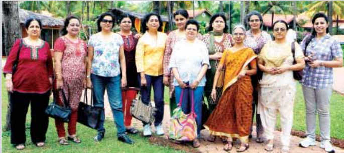
Ladies' Day Out! Spouses of the Top Management Team pose for a Picture Perfect.

■ On 22nd July 2011, the Department of Public Enterprises organised a one-day workshop on Performance Management System and Performance Related Pay for 19 CPSEs of the Eastern Region. The workshop conducted in Hotel Hindustan International was coordinated by Balmer Lawrie.