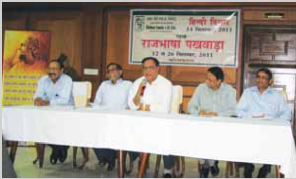
राजभाषा पखवाड़ा उद्घाटन समारोह में उपस्थित अध्यक्ष व प्रबंध निदेशक तथा निदेशकगण

प्रधान कार्यालय में इस बार 12-26 सितम्बर 2011 के दौरान निम्नलिखित कार्यक्रम आयोजित किए गए :