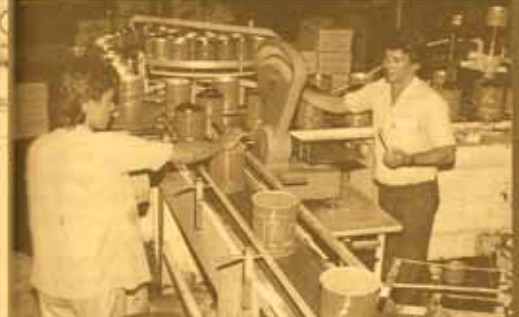
Pack-filling at the Company's ginner plant at Calcutta