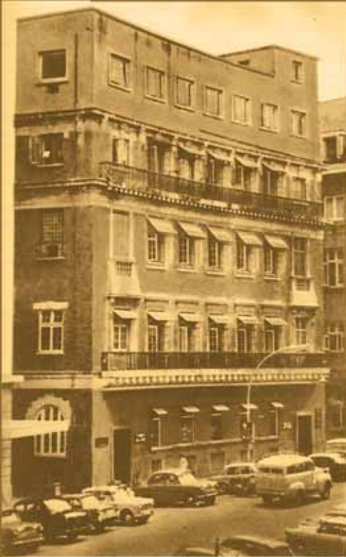
Balmer Lawrie office building on 5 Ghatam Road in Bombay during the 1960s