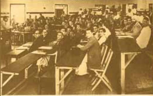
Tea auction in progress at Calcutta in the 1940s. Balmer Lawrie representatives were invariably prominent participants. (See fourth row, middle.)