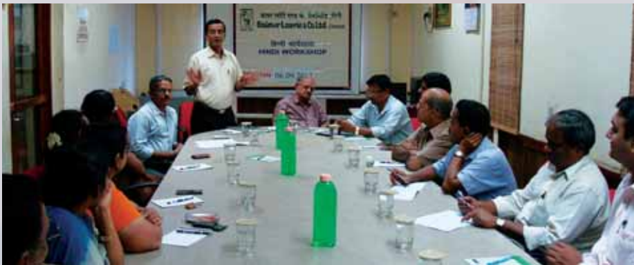
चैन्नै कार्यालय में राजभाषा कार्यशाला

1 से 14 सितम्बर 2011 तक पखवाड़े का आयोजन किया गया जिसमें निम्नलिखित कार्यक्रम आयोजित किए गए।