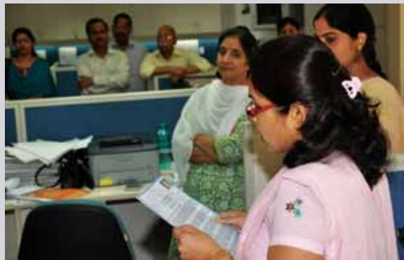
दिल्ली कार्यालय में हिन्दी दिवस के अवसर पर माननीय गृहमंत्री श्री पी चिदम्बरम के संदेश को पढ़ कर सुनाते हुए

राजभाषा ज्ञान प्रतियोगिता, हिंदी निबंध लेखन प्रतियोगिता, हिंदी में सर्वाधिक कार्य के लिए सम्मान।